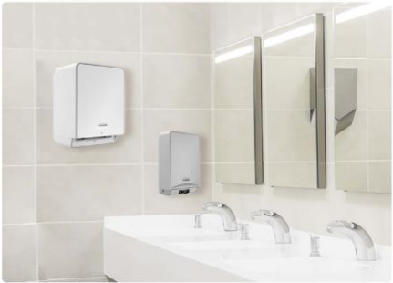
Bathroom & Cleaning