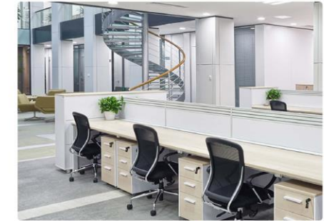
Furniture & Fitout