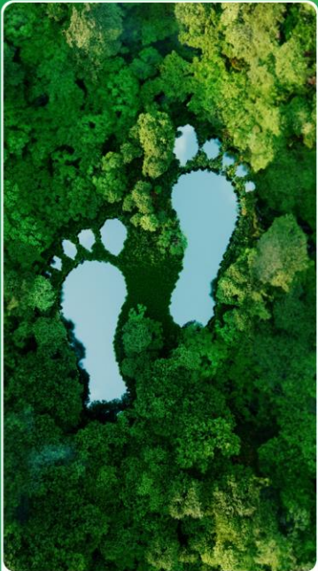
Net Zero Operations