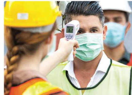
WHS & PPE