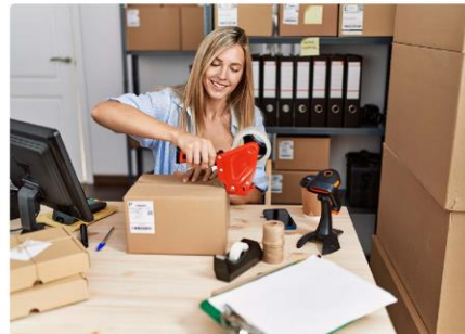
Mailroom & Packaging