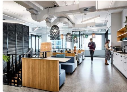
Kitchen & Hygiene